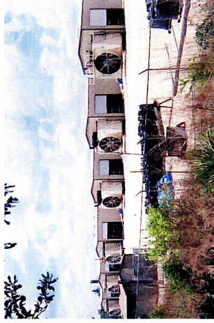
Photo of a gas compressor station.

You can hear a loud annoying hum when near them. However, they also emit a harmful Low Frequency Noise, (LFN) which can travel at least 5 miles.